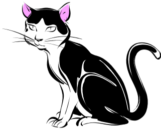
Jimmy the Cat

Here is a graph showing Jimmy's age in months vs. his weight in pounds. I've drawn a line that seems to fit the data points. Your first task is to determine the equation of the line which models Jimmy's growth.